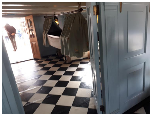
Admiral Nelson's sleeping area (above) vs. crew's sleeping area (right)