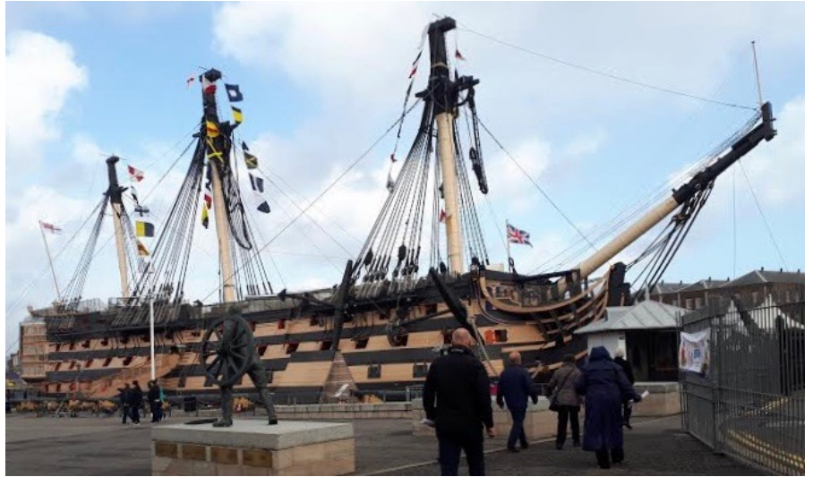
HMS Victory at Portsmouth Historic Boatyard, England