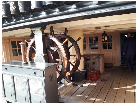
The helm on the quarter deck, under the shelter of the poop deck.

We are online at nbpss.on.ca or on Facebook.