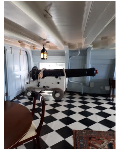
But no space is wasted and they had guns there too.