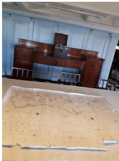
This is "The Great Cabin" which was Admiral Nelson's home at sea.